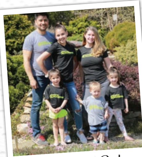
Happy Mother's Day!